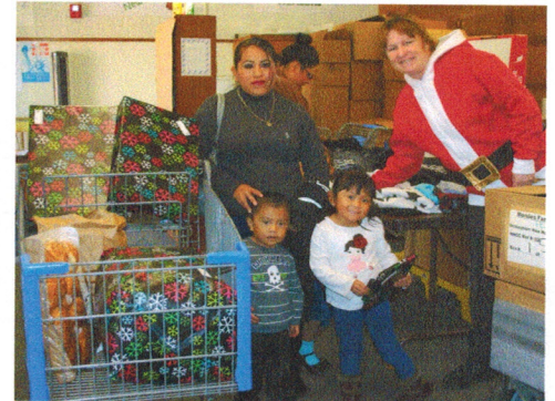
Below: Hot Topic staff helping with Christmas distribution of gifts and groceries to families in need, December 16, 17 & 18, 2015.