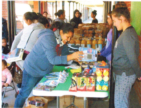
Above: Families receiving Christmas presents and groceries after a parent education class at Valinda School.