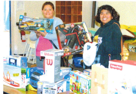
Above: Sparks moms pick out Christmas gifts for their kids to have a happy holiday.