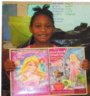
A very happy student from Sparks Elementary excited about her Christmas gifts.